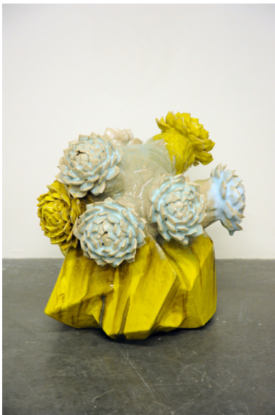
Matt Wedel, Flower Tree , ceramic, 2011. Courtesy L.A. Louver, Venice, CA © Matt Wedel