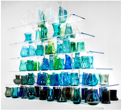
The Break, blown glass, acrylic shelving, 2013. Courtesy of the artist.