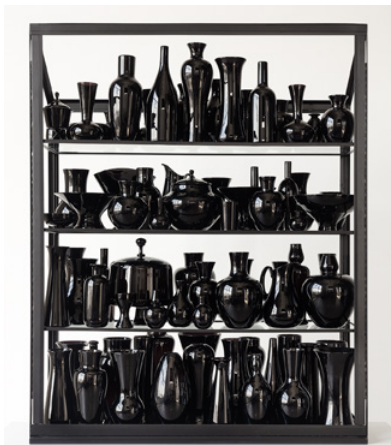
As Clear as the Experience , blown glass, steel and plate glass, 2017. Courtesy of the artist. Photo: Fredrik Nilsen.

LOS ANGELES - The Craft & Folk Art Museum (CAFAM) presents Katherine Gray: As Clear as the Experience , a solo presentation of the Los Angeles-based glass artist. Gray is known for installations made from hand-blown glass vessels coupled with theatrical lighting to form vivid projections on the walls . Drawing on the rich traditions of glassblowing, as well as her personal explorations into unique surface treatments, dramatic lighting, and viewer interaction, Gray's work urges viewers to experience glass beyond its function. Curated by CAFAM exhibitions curator Holly Jerger, this will be the artist's first solo museum exhibition in Los Angeles. It features 10 large format works, including an immersive installation that brings visitors into the sights, sounds, and smells of the glassblowing studio, also known as the hot shop. The exhibition takes place from May 27 to September 9, 2018.